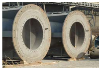
Pictured (before, left, and after, above): A recent refurbishment project, a Cold Water Pump at the largest Power Plant in Karachi, Pakistan.